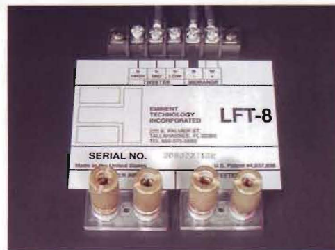
The bi-wire rear terminal panel also carries High, Mid and Low tweeter settings.

If there was any slight colour I suspect it came from the anodes of the 845s, for when I swapped to our Leema Pulse not only did I have to